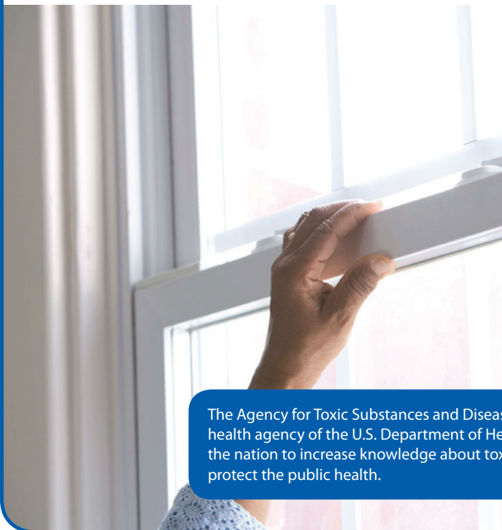
Keep home ventilated

You come into contact with chemicals every day, but that does not necessarily mean that you will get sick. The human body has a good defense system. It usually tries to get rid of harmful substances.