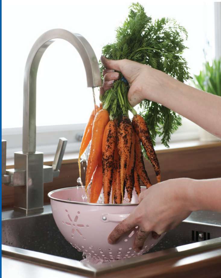
Wash fruits and vegetables